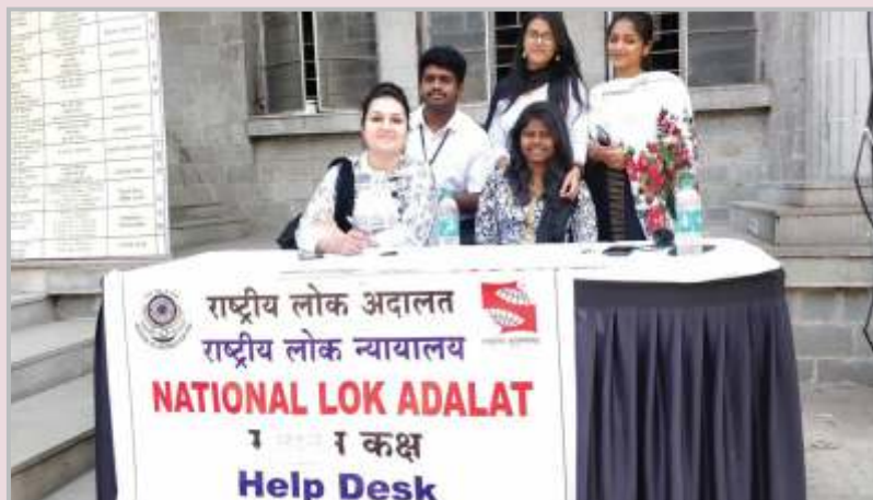
Students of SLS-P at the National Lok Adalat