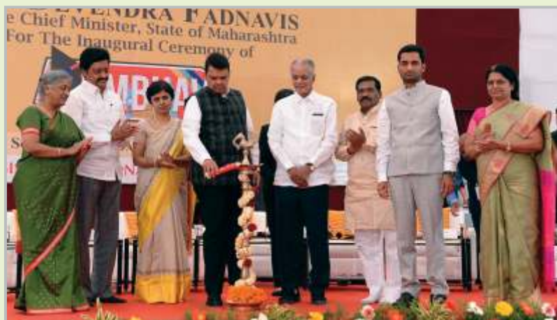
Lighting of the Lamp by Shri Devendra Fadnavis, Hon'ble Chief Minister, Maharashtra at the inauguration of 10th edition of Symbhav, 2018