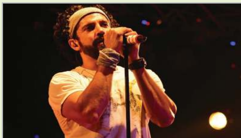
Symbhav, 2018 witnessed an electrifying performance by Farhan Akhtar Live which sent the spirits soaring

Theme for the decennial celebration, 'Global Village', truly encapsulated the principle of Vasudhaiva Kutumbakam , the foundation on which Symbiosis as an institution stands. The cultural fest- inaugurated at the hands of Shri Devendra Fadnavis, Hon'ble Chief Minister, Maharashtra as the Chief Guest on 21st February - gathered momentum with a spectacular opening dance followed by 'The Fallen Beauty', a dramatization of Budhadev Karmaskar Vs. State of West Bengal (2011) case. The play addressed issues pertaining to sex workers and the violation of their human rights.