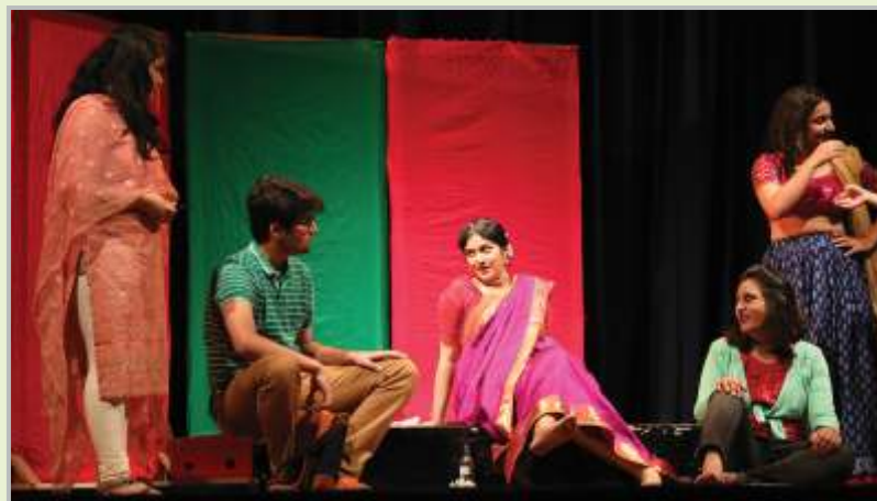
'The Fallen Beauty' – the Law Theatre at the Inaugural Ceremony of Symbhav 2018