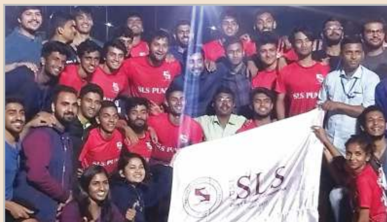
SLS Men's Football team celebrating their silver