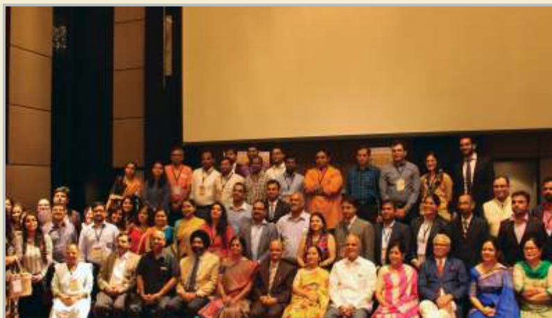
Dignitaries at the Annual Alumni Meet, 2018