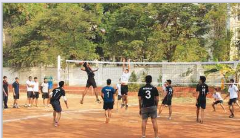
SLS-P Men's Volleyball Team