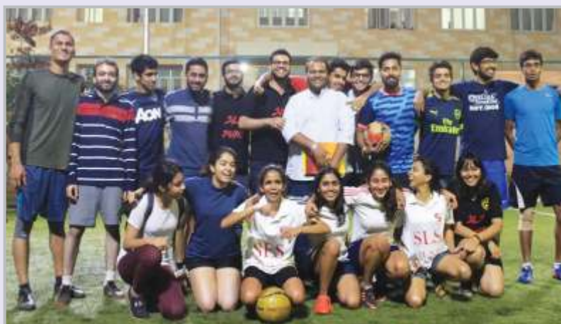
The organisers of the first Inter Committee Futsal Tournament