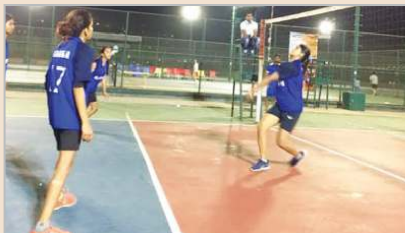
Women's Volleyball Team at Magnus