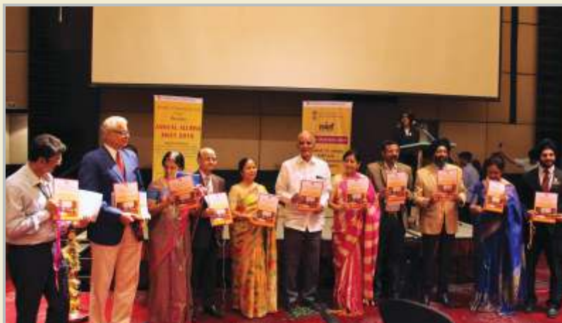
Release of the Alumni Newsletter, 'Alumni Nexus'