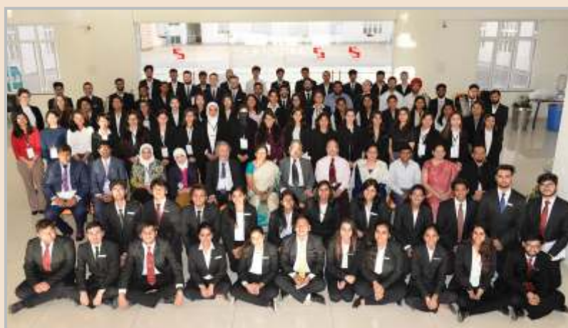
Dignitaries with all the participants and members of the Student Bar Association at SICTA, 2018