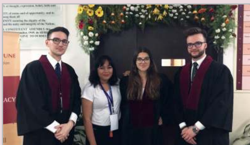
Students from University of Gdansk, Poland with a member of CLCLC