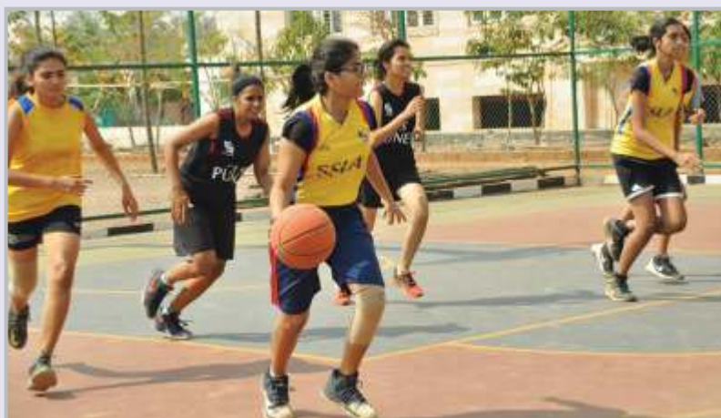
SLS-P versus Symbiosis School of Liberal Arts