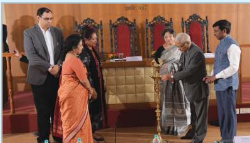
Lighting of the Lamp by Dignitaries at Nani A. Palkhivala Memorial Inter-Collegiate Elocution Competition