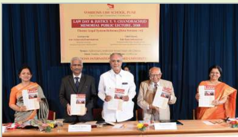
Release of LexET, the Bi-Annual College Newsletter